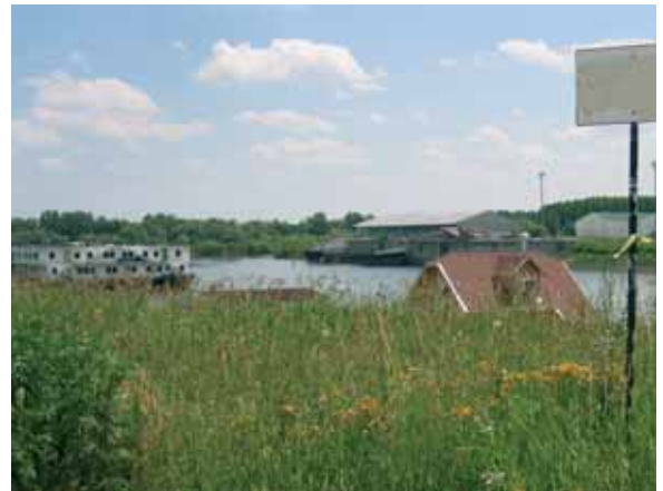
The seawall of the winter port was safely passed during the first drive.

Adapted to the individual project conditions, Herrenknecht trenchless technology provides safe and fast installation of jacked pipes. In April 2005, the tunnelling process began at the jobsite directly adjacent to the seawall of the winter port, below the water level of the river "Tisza". Soon after construction began, the City issued a flood warning. The EPB 2000 handled the high groundwater levels caused by the freeze-thaw cycle and flooding safely and without settlement. The newly formed jobsite team masters the project perfectly. Maximum daily production rates of 33m on the second drive are proof of their skill and expertise as well as organized jobsite logistics.