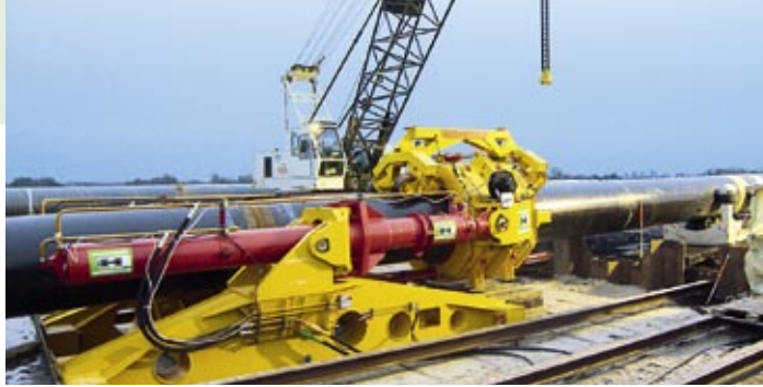
Additional thrust and pulling force for pipe installation with the Pipe Thruster.