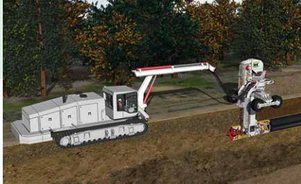
Surface vehicle with control cabin.