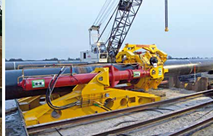
Herrenknecht Pipe Thruster.