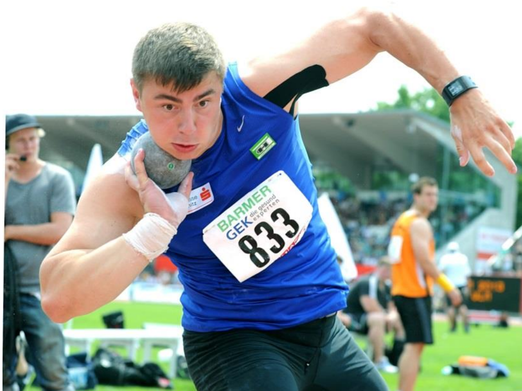
Winning World Championship gold with a top performance: David Storl showed nerves of steel in Moscow.